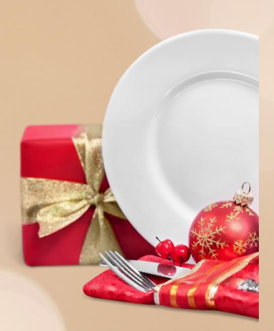
Price per Guest 43.

Fresh Baked Sourdough Rolls & Butter Corn Chowder Glazed Carrots Herbed Stuffing Mashed Potato & Gravy Coffee & Tea Dessert Selection