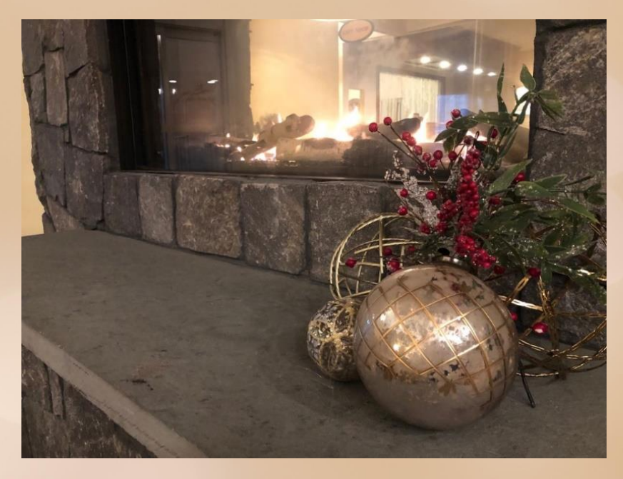
· All room rentals include a personal Event Coordinator ·